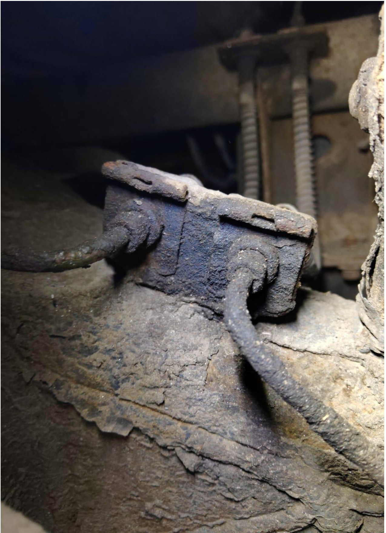
Corrosion to pipes