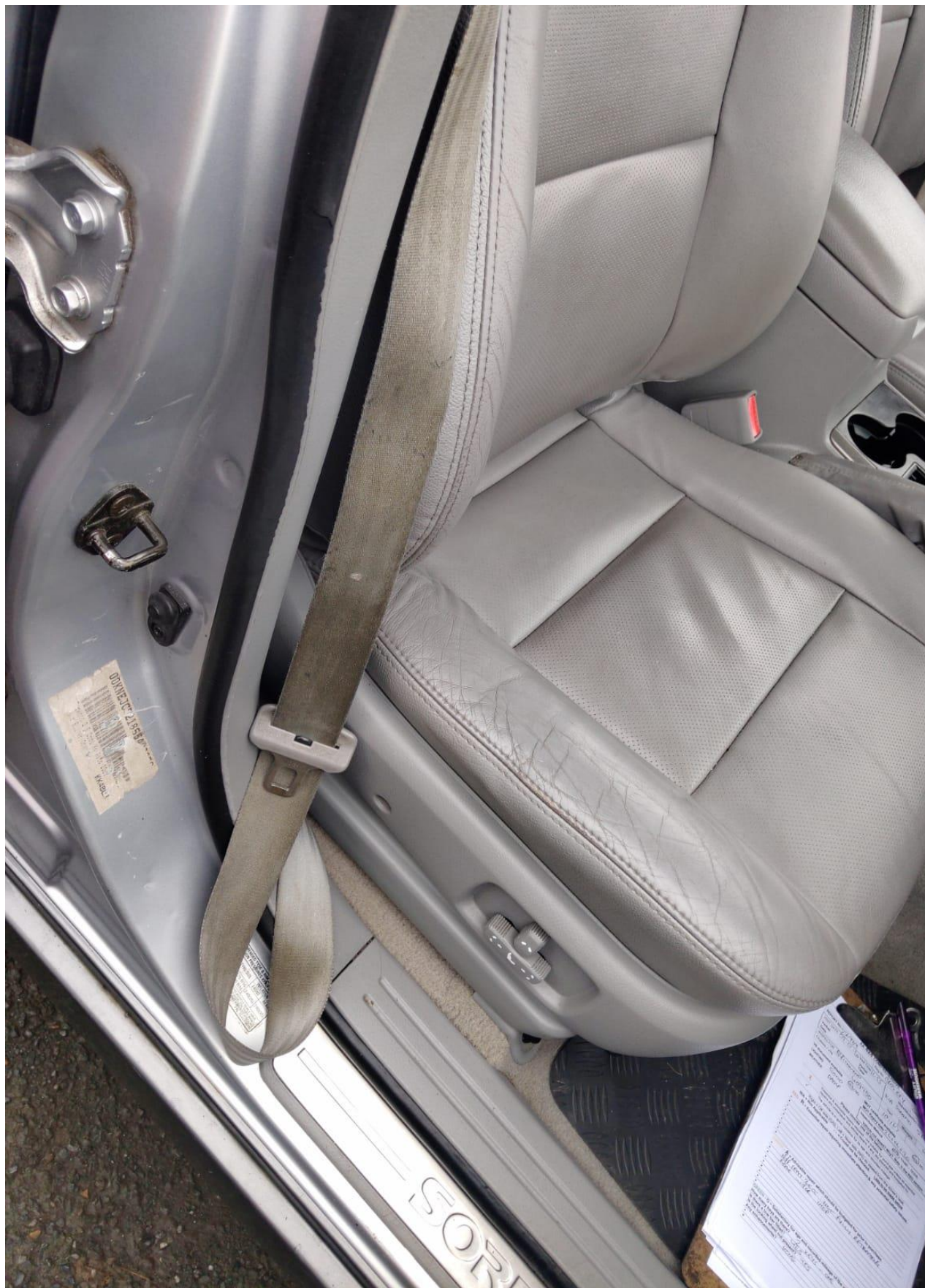
Seat belt not retracting