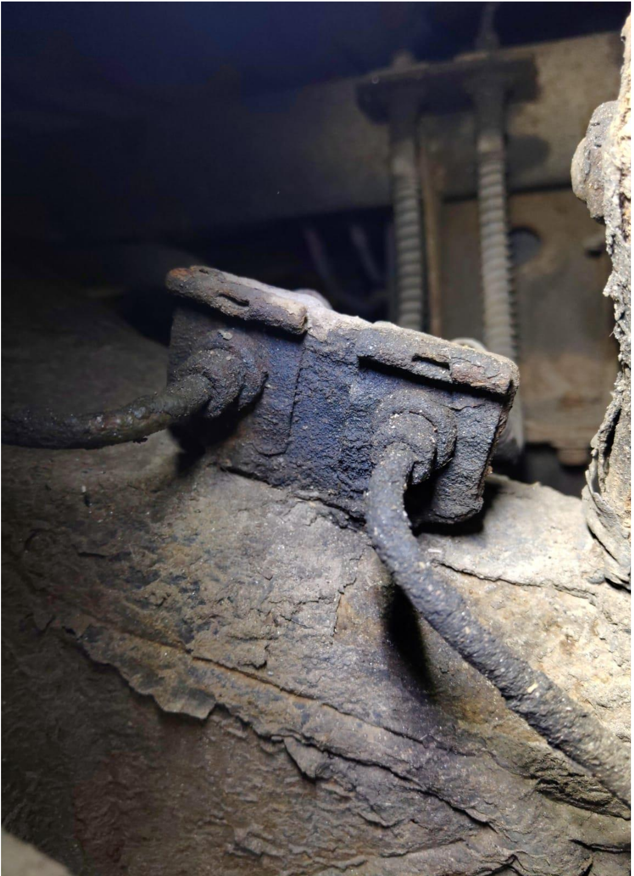
Corrosion to Brake pipes