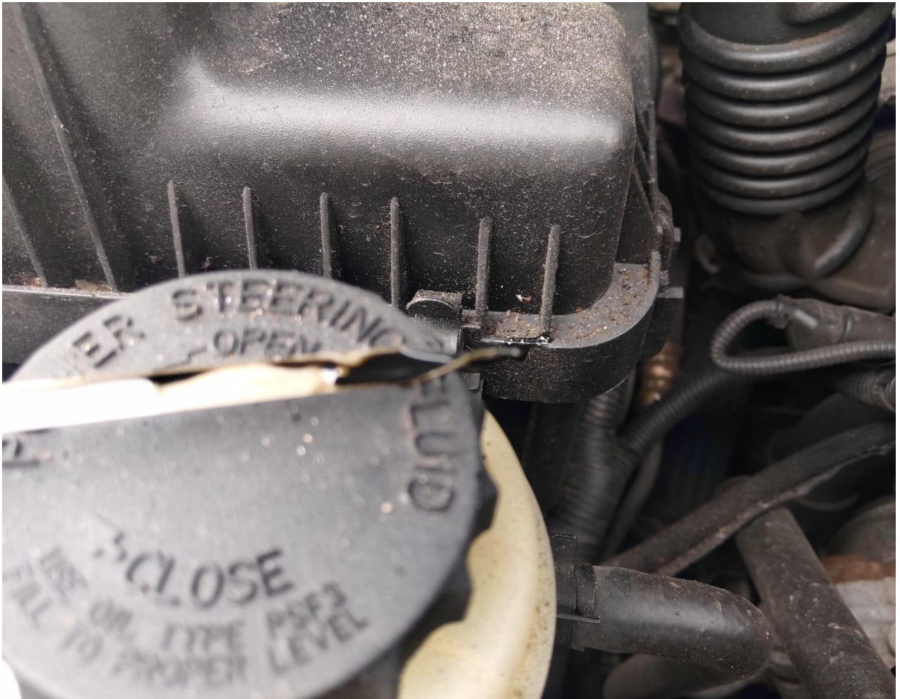
Engine oil level