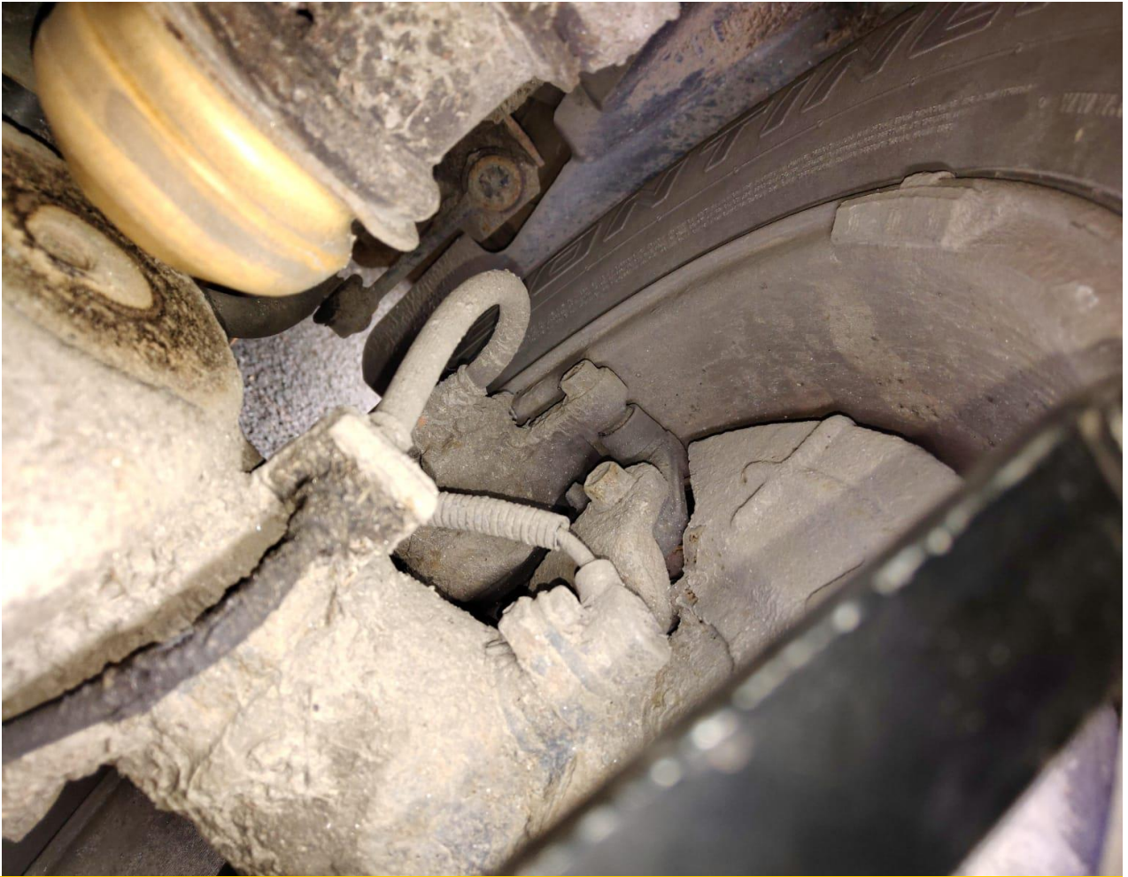
Rear brake pipes / suspension