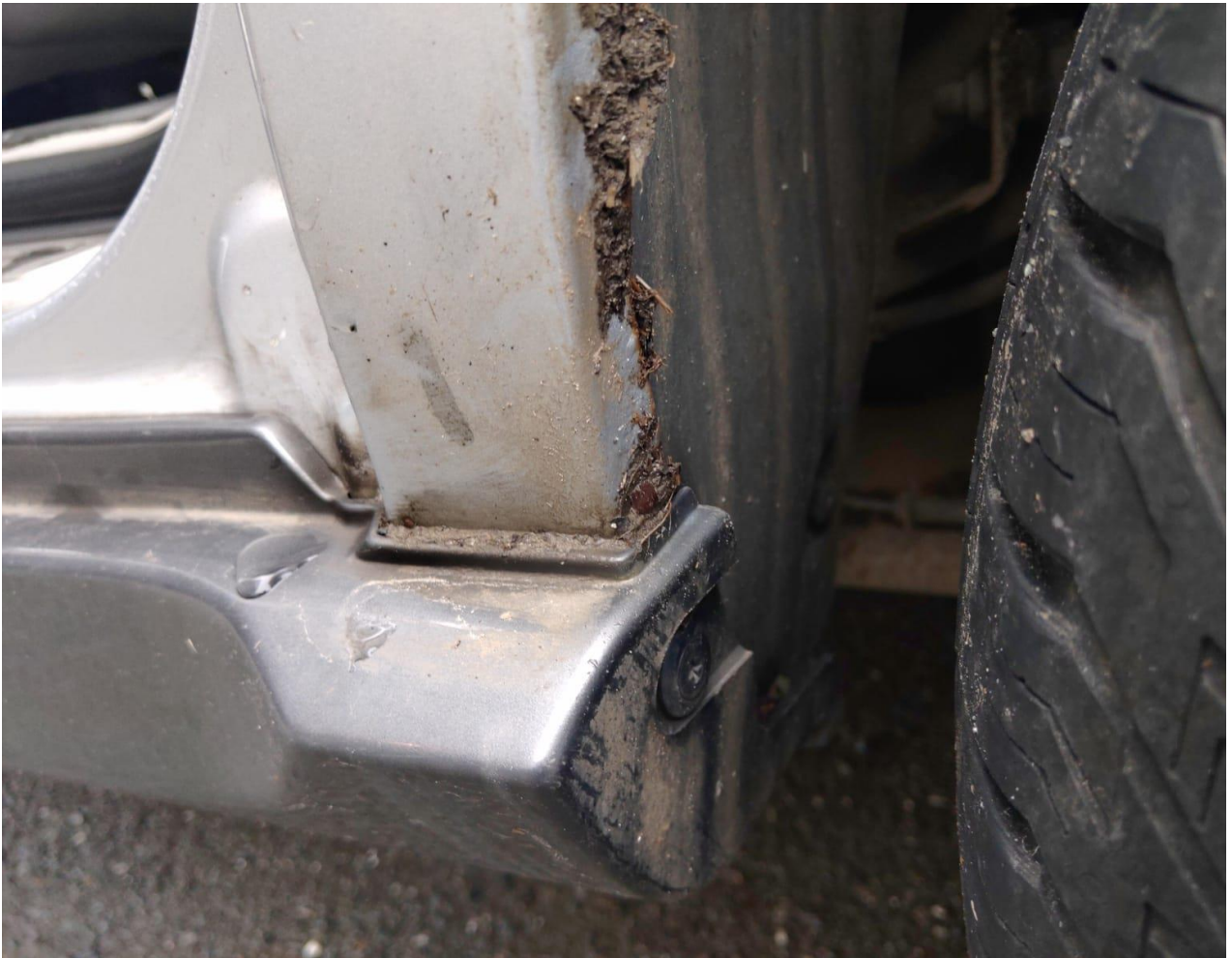
Corrosion to arch