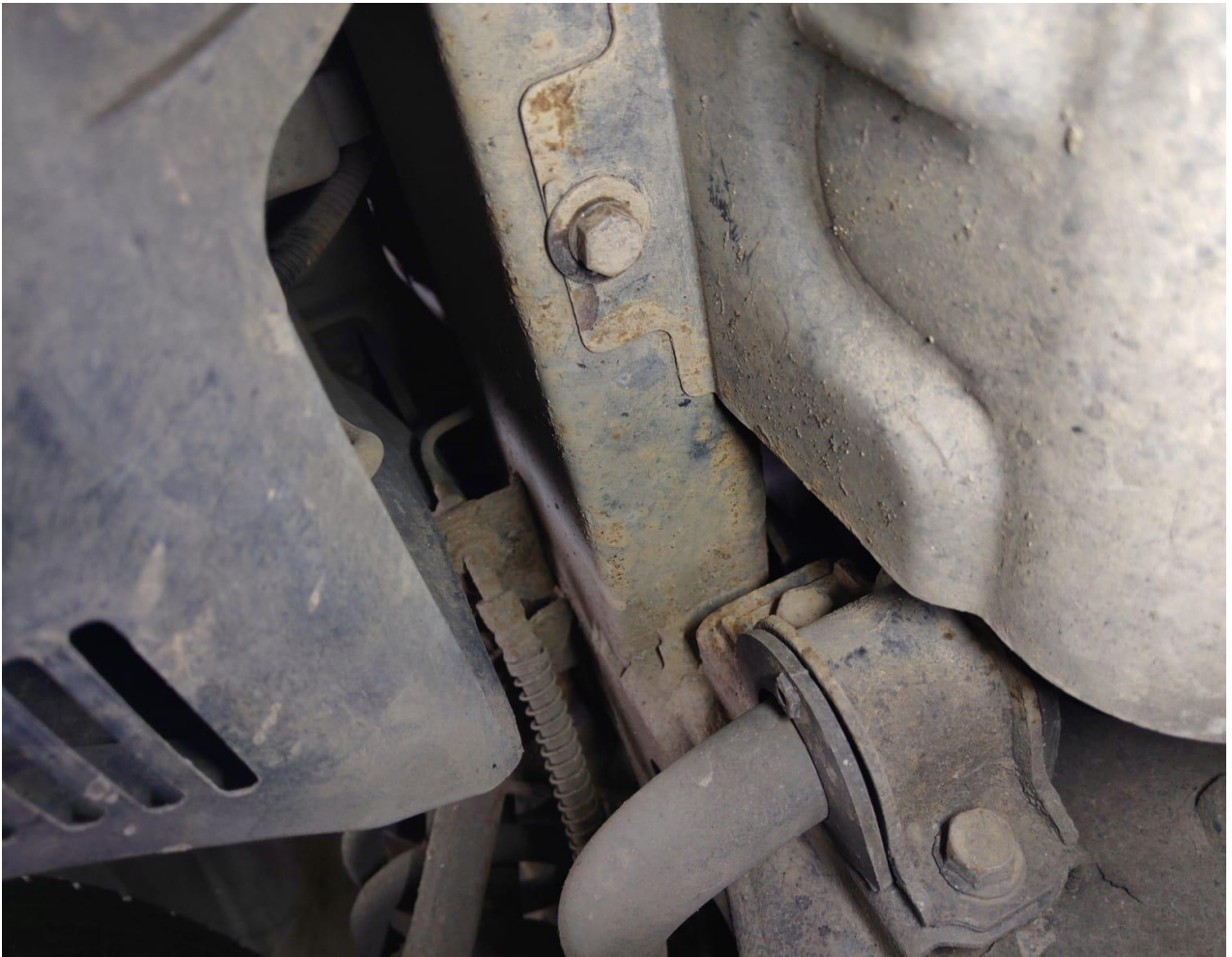
Underside surface corrosion