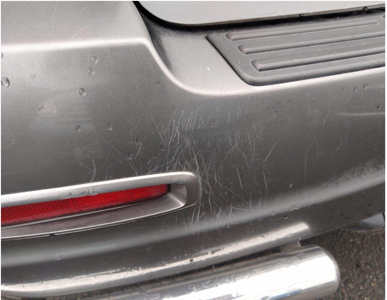
Paint Scratches to bumper