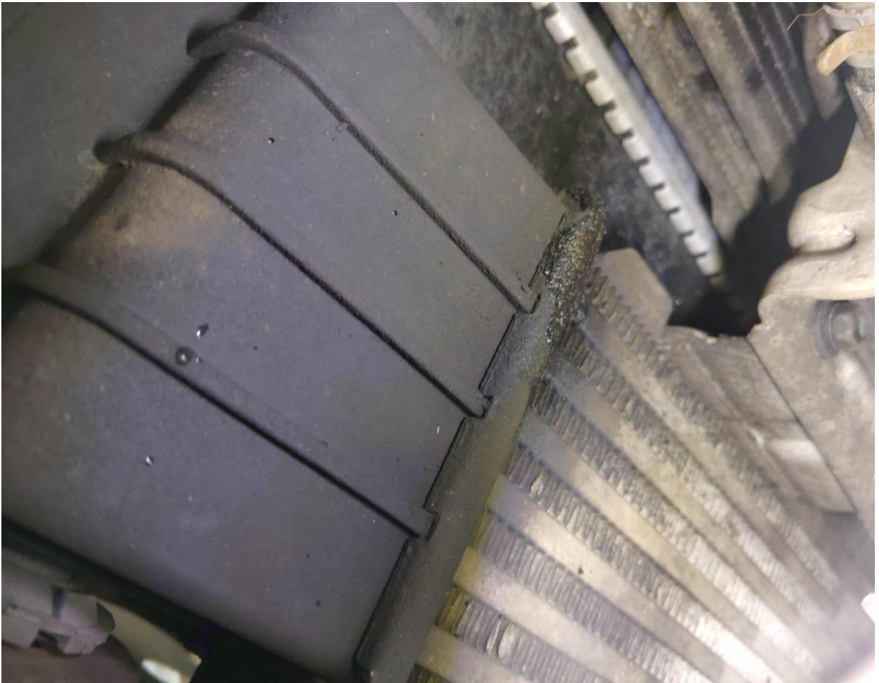
Oil Leak at intercooler