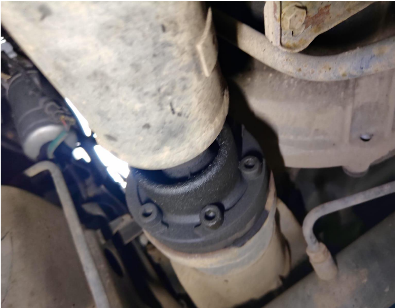
Oil Leak to propshaft