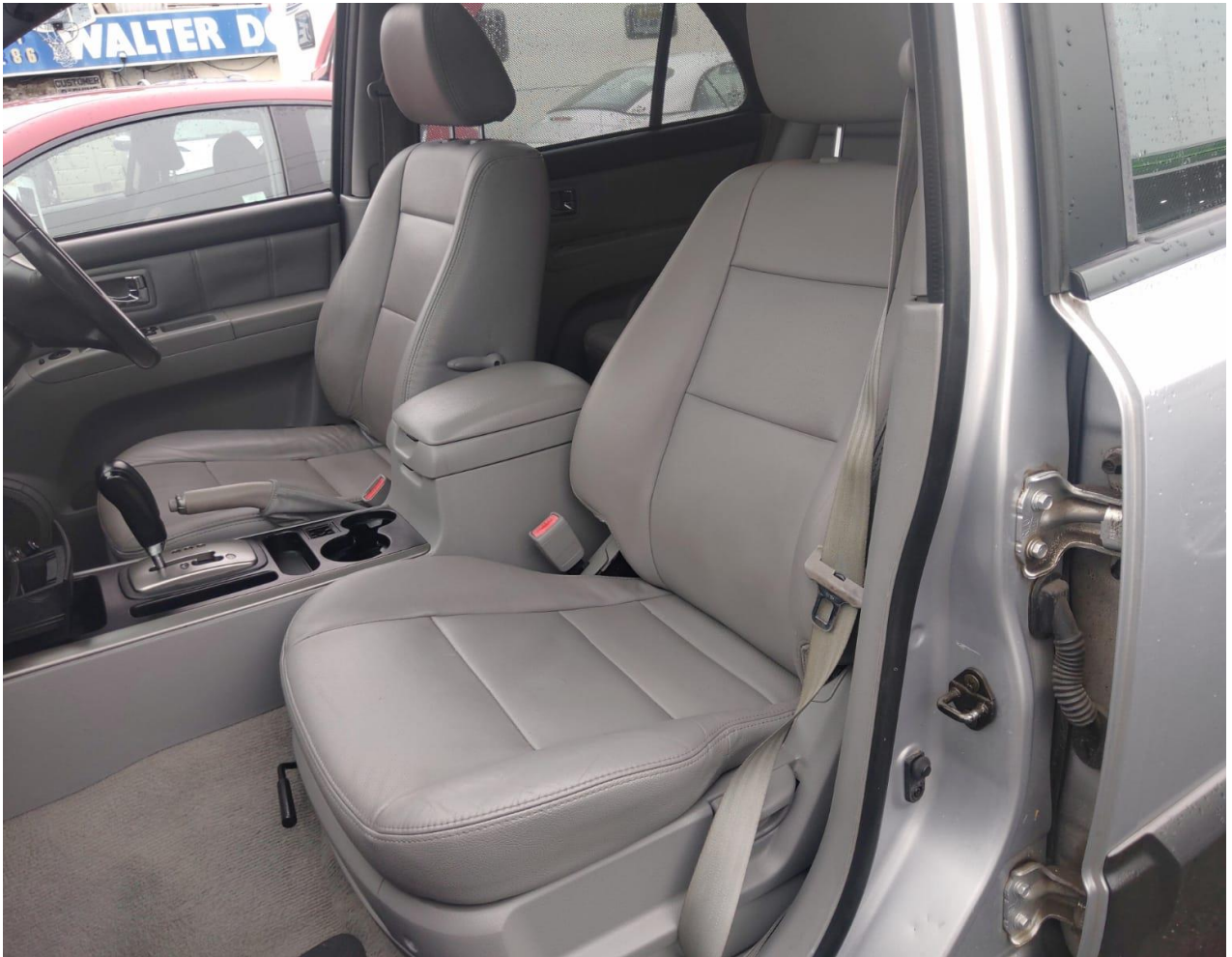
Front interior seats