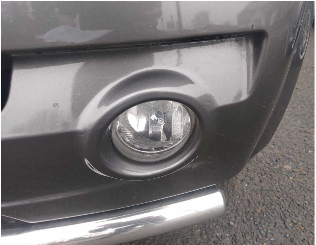
Fog Light insecure