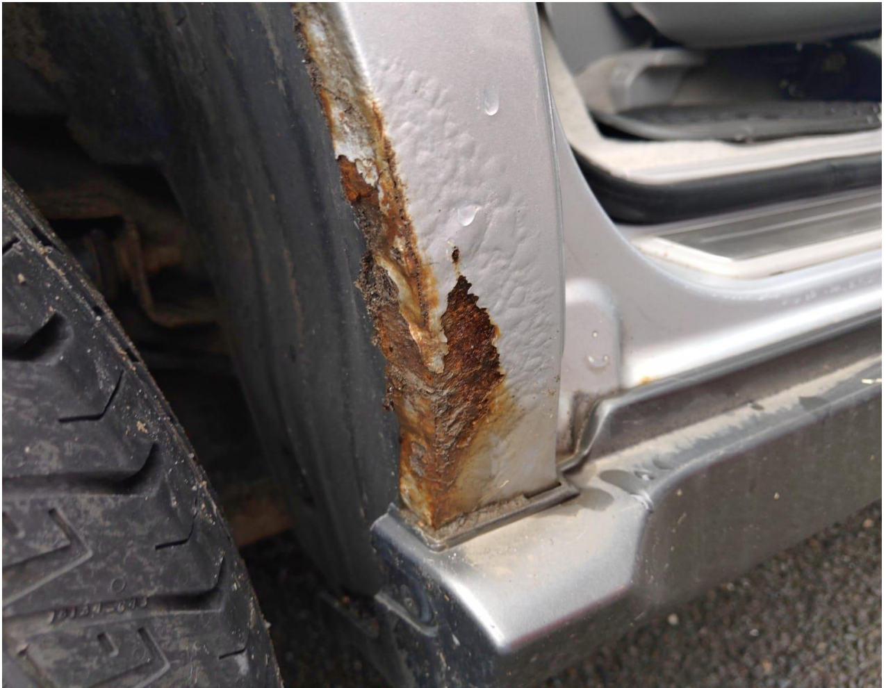
Corrosion to arch